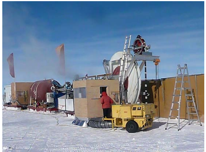
ARA hot water drilling at South Pole.

IDDO kicked off development of the Foro 3000 Drill system during the first quarter. The Foro 3000 concept builds on the Intermediate Depth Drill (IDD) system and will allow for deep coring down to 3000 meters depth. A detailed task list was developed and other important documentation such as the Project Management Plan and the Engineering Requirements were completed and formally released. Detailed design work was completed for updates to the IDD's anti-torque components to allow for accommodation of a larger-diameter cable. The IDD