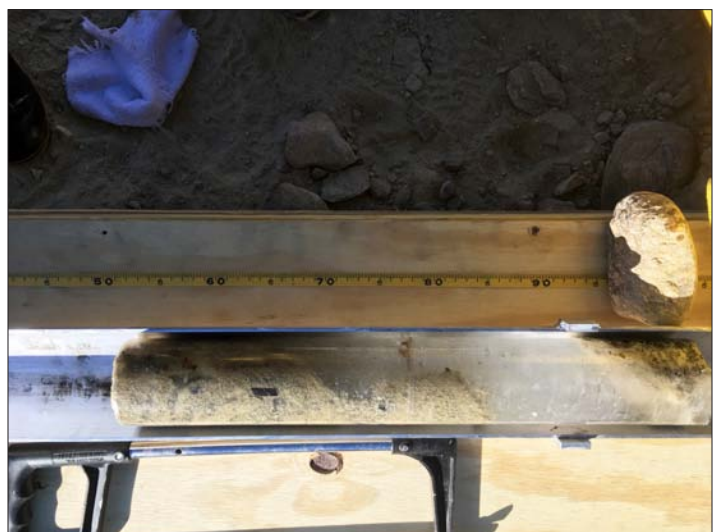
A mixed-media core consisting of ice, silt and rock collected with the Winkie Drill in Ong Valley, Antarctica.