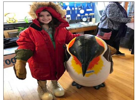
Students and their parents engage in hands-on activities while learning about ice core science and the challenges of working in the polar regions.