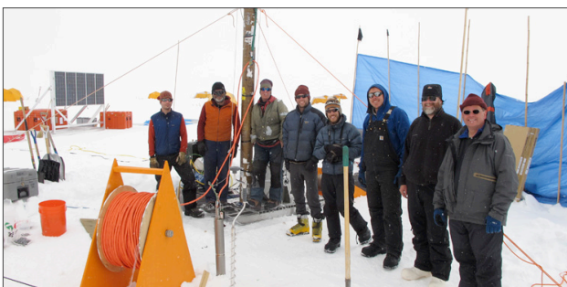
GLISN field team.

Despite battling bitter winds and cold April temperatures in Greenland, P.I. Rick Forster's Arctic Circle Traverse (ACT) field team successfully drilled and processed over 200 meters of ice core at four traverse sites in Greenland under the leadership of IDDO Lead Driller, Terry Gacke. The cores may yield insights on snow accumulation. Meanwhile, in the center of the ice sheet, the field team for P.I.'s David Noone and David Schneider drilled a shallow core array near Summit Station, Greenland using an IDDO PICO 4" hand auger system and Sidewinder kit. At Raven Camp on the ice sheet, activity focused on a detection system for ice sheet movement; a 300-meter borehole was drilled and a seismometer successfully deployed in May for P.I. Kent Anderson's Greenland Ice Sheet Monitoring Network (GLISN) project. Under the leadership of IDDO Lead Driller Bella Bergeron, IDDO driller Terry Gacke, IDDO engineer Tanner Kuhl and the GLISN science team utilized the 4-Inch drill system winch to control descent of the seismometer. In addition, three solar arrays were constructed, surface seismometers buried, wind turbines and GPS antennas erected, and interconnecting cables buried.