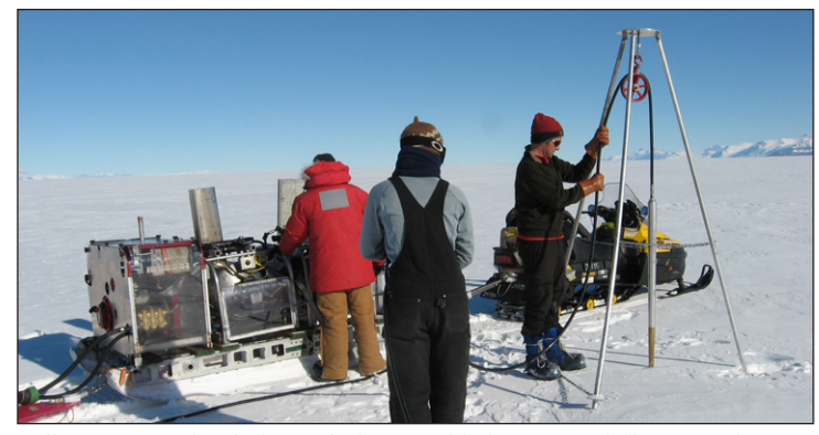
Drilling seismic shot holes with the portable hot water drill on Beardmore Glacier.

A very successful Antarctic field season was brought to a close in February, with all field personnel returning to the U.S. PI Howard Conway's field team had excellent success with an IDDO portable hot water drill on Beardmore Glacier, drilling nearly 170 shot holes and completing four seismic transects. At WAIS Divide, new and revolutionary technology with the DISC Drill enabled collection of replicate cores on the uphill side of the borehole. The field team was able to surpass the initial goal of 252 meters of replicate core, collecting a total of 285 meters of excellent ice core from depths of particular interest. This field season was the culmination of six years of drilling operations at WAIS Divide Camp. A variety of hand auger projects were also successfully completed in Antarctica.