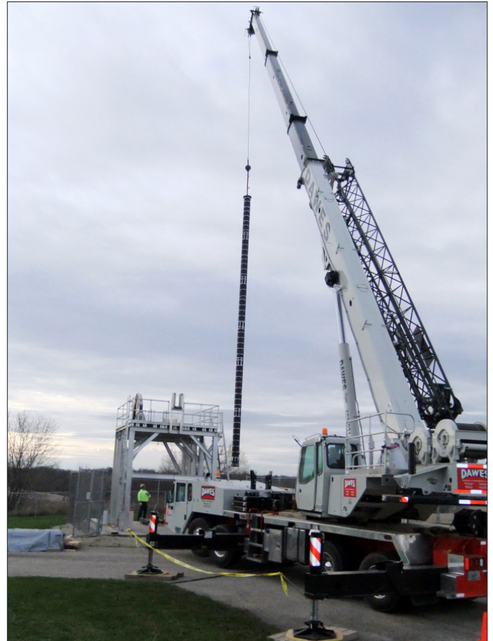
Preparing the temporary ice well at PSL for the North American Test of the ASIG Drill.