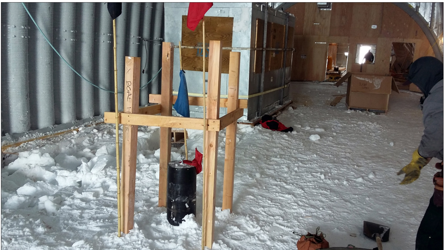
The borehole casing extension at WAIS Divide, Antarctica.

IDDO Driller Jim Koehler arrived at WAIS Divide on 1/14/16, following weather and aircraft delays, and worked expediently to prepare the remaining DISC Drill items for return shipment to the U.S. Koehler also worked with ASC personnel to extend the borehole casing to two feet above the Arch floor level.