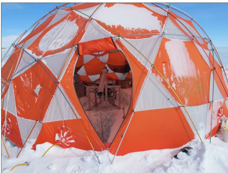
Drilling tent and Eclipse Drill in operation at a snowy Allan Hills, Antarctica.