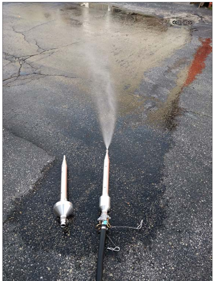
Left top: Testing of the SLLID at the IDDO warehouse in Madison, WI. Left bottom: The SLLID packed and ready for deployment to the field. Above: The drill heads for the SLLID.