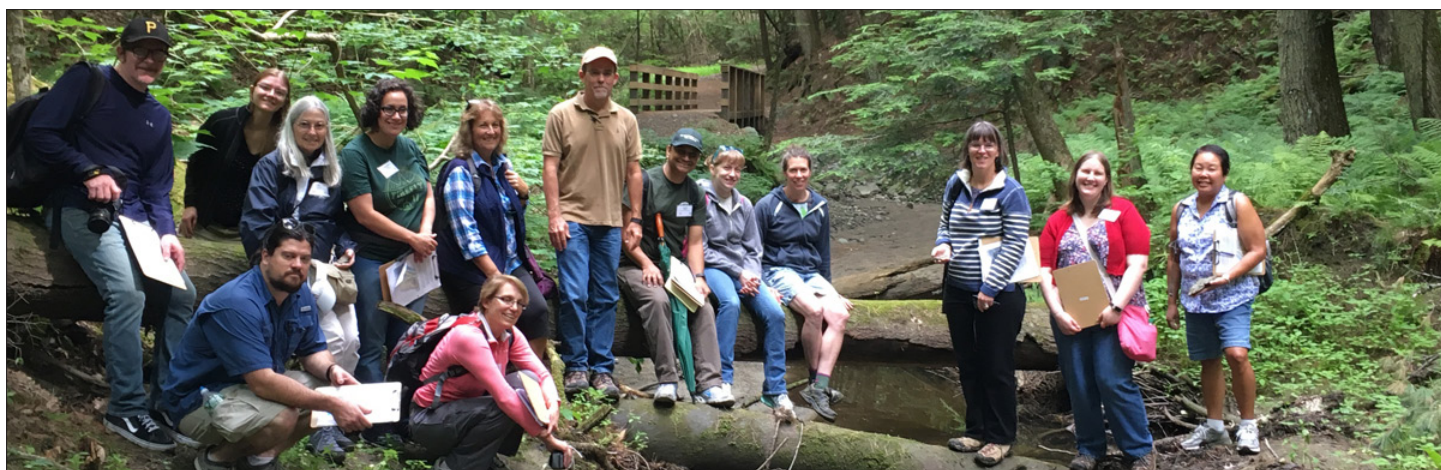
Group photo of the participants and facilitators from the 2017 School of Ice workshop.

The application is available at http://climate-expeditions.org/school-of-ice-application-and-video/ . Applications are due by January 31, 2018.