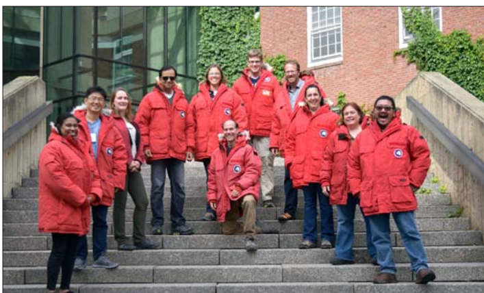
Class of 2018 School of Ice.