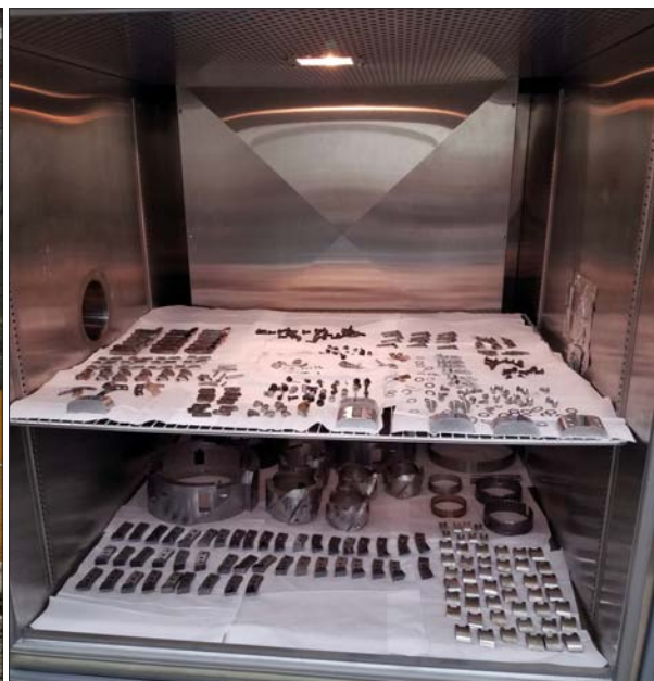
Left: Ultrasonic cleaning of cutters and other metal parts. Right: Baking of drill parts in a Tenney environmental chamber at 50 °C.