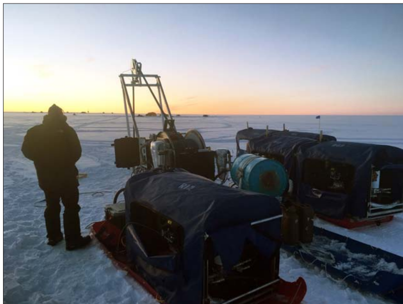
Left: RAM Drill testing at Raven Camp, Greenland, showing a smooth, consistent borehole diameter. Right: RAM Drill testing at night near Raven Camp, Greenland.