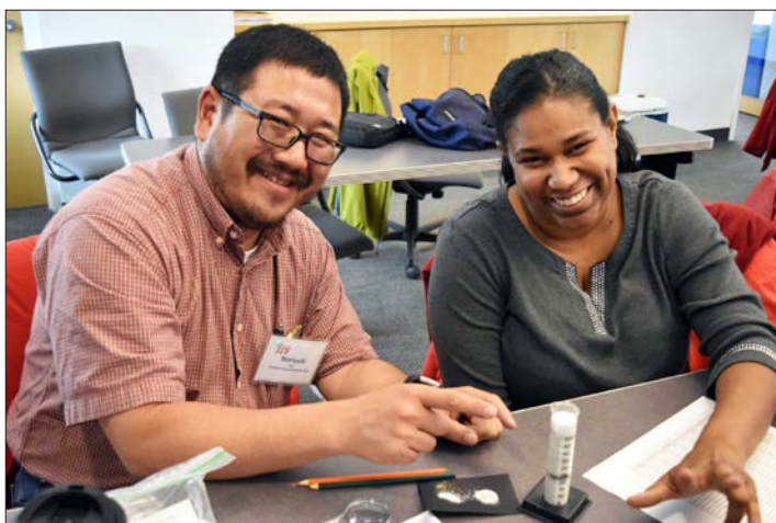
SOI participants involved in a hands-on activity.