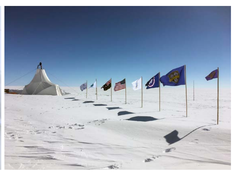
Exterior of the new Blue Ice Drill tent.