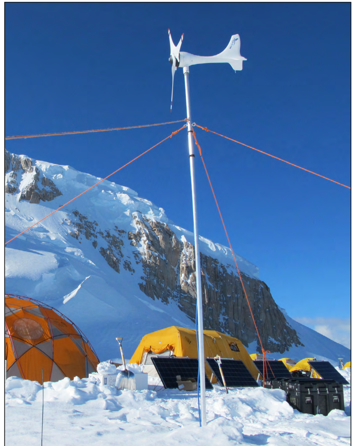
New solar and wind power system used for Badger-Eclipse drilling in Denali National Park.