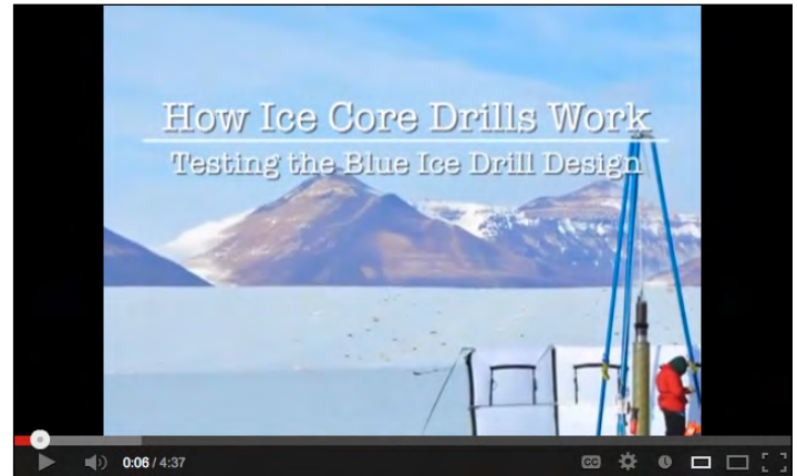
Screen-shot of the new video, entitled "How Ice Core Drills Work", that explains how the double barreled Blue Ice Drill works.