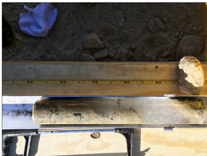
A mixed-media core consisting of ice, silt and rock collected with the Winkie Drill in Ong Valley, Antarctica.