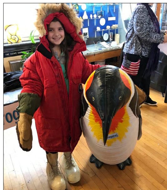
Students and their parents engage in hands-on activities while learning about ice core science and the challenges of working in the polar regions.