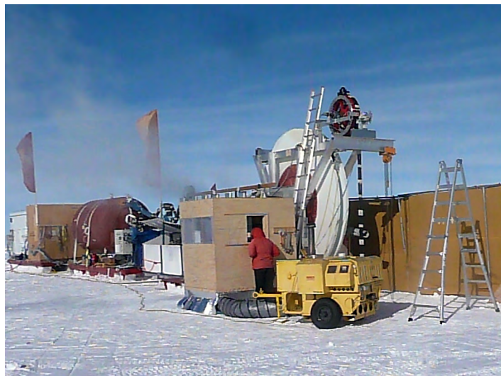
ARA hot water drilling at South Pole.

Several components were received that were ordered in late PY 2017, including a spare winch gearbox, winch motor, load pin and tower tubing. Control box functionality testing was initiated. The sonde design is now finalized and fabrication has begun.