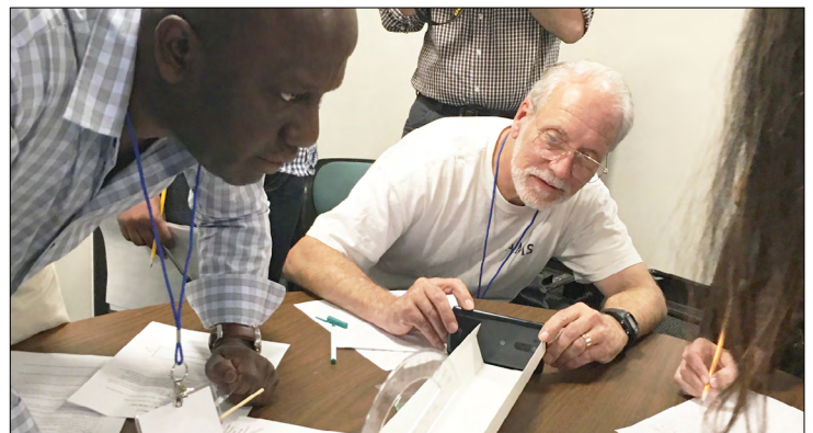
Participants in the 2017 School of Ice workshop will participate in similar activities to this lab from last year's workshop.