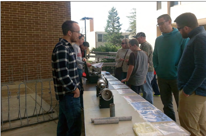
Visitors in Madison, WI observe drill parts and photos as engineers answer questions.