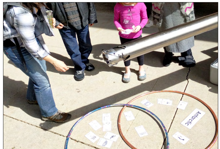
Visitors in Madison, WI play "Polar Opposites" where they learn about the extremes of working in Greenland and Antarctica.