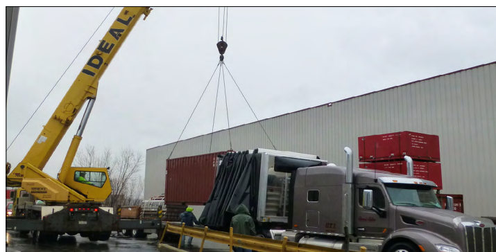
The 2016-2017 Antarctic field season retrograde cargo included a 20-foot long shipping container returning from WAIS Divide that required a crane for unloading.