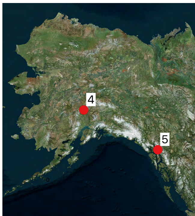
Map of Alaska showing 2019 Arctic field season locations. The numbers shown on the maps correspond to the project numbers in the text.