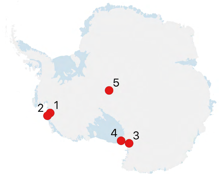
Map of Antarctica showing 2019-2020 Antarctic field season locations. The numbers shown on the maps correspond to the project numbers in the text.