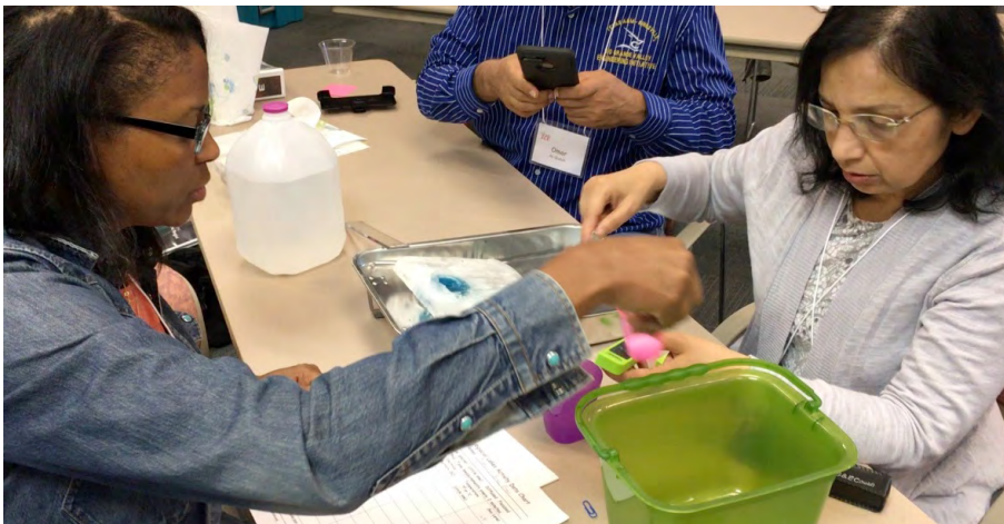
The School of Ice teaches hands-on, active learning inquiry-based labs to workshop participants.

The School of Ice is an NSF-funded professional development program for college faculty and high school teachers who teach advanced science courses. This program will train participants to understand paleoclimate evidence derived from ice cores and acquire the skills necessary to bring this exciting inquiry into new and existing Earth and environmental science classes on their campuses. The experiential nature of this workshop will build background knowledge of cutting-edge research and empower participants to communicate authentic paleoclimate research practices, ice core data, and results to their students.