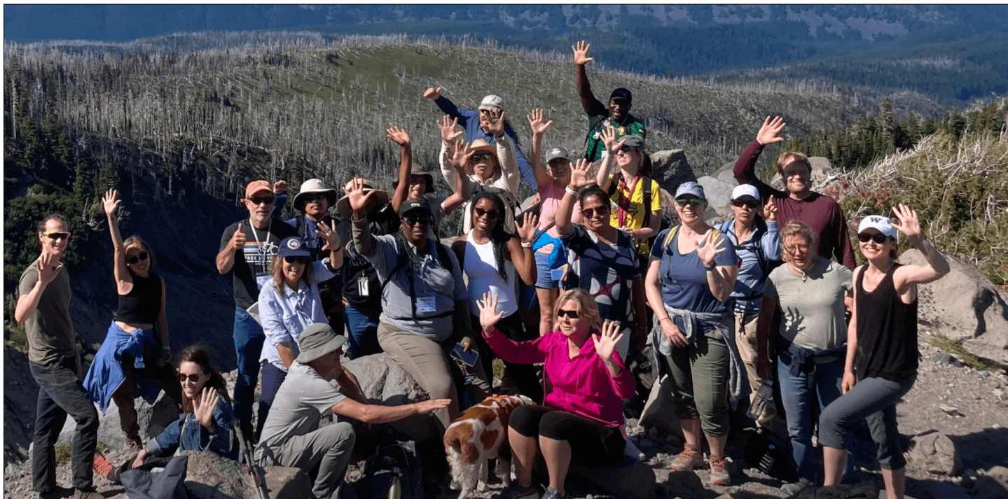
Group photo of participants from the 2022 School of Ice. For more information about the program, visit https://icedrill-education.org/school-of-ice/ .