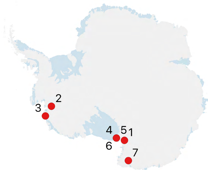
Map of Antarctica showing 2023-2024 Antarctic field season locations. The numbers shown on the maps correspond to the project numbers in the text.