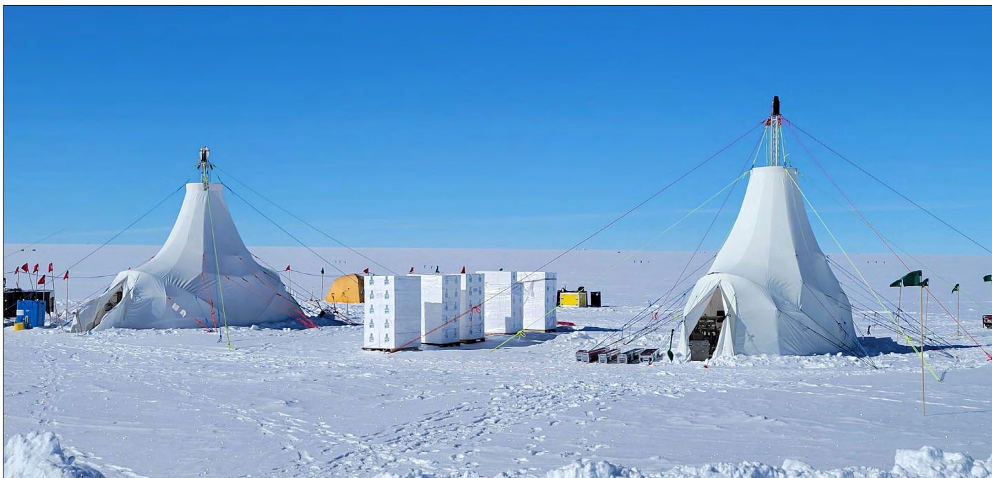
Two IDP MAST (Mast Anchored Suspended & Tensioned) tents at Summit Station contain the 700 Drill and Foro 400 Drill/Eclipse Drill training operations.