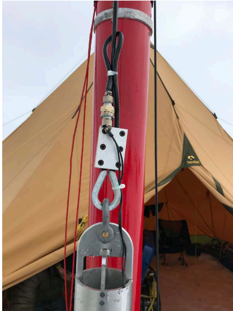
Figure 3. Thermal drill mechanical and electrical connections.