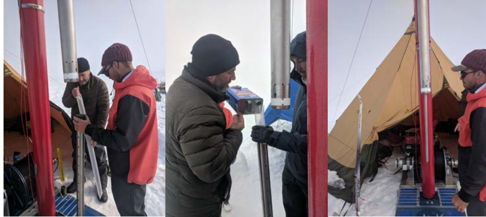
Figure 7. Ethanol delivery procedure.