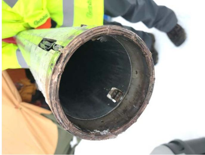
Figure 2. Thermal Drill heat ring.

7.3.2.1 Power range – The heat ring is rated at 1800 W (180 V). To keep from burning out heat rings, they should not be exposed to voltages higher than 180 V. In addition, this power limit should only be applied to the heat ring when it is immersed in water, not when drilling in firn. Never increase the power greater than 50% (approximately 90V) while drilling in firn.