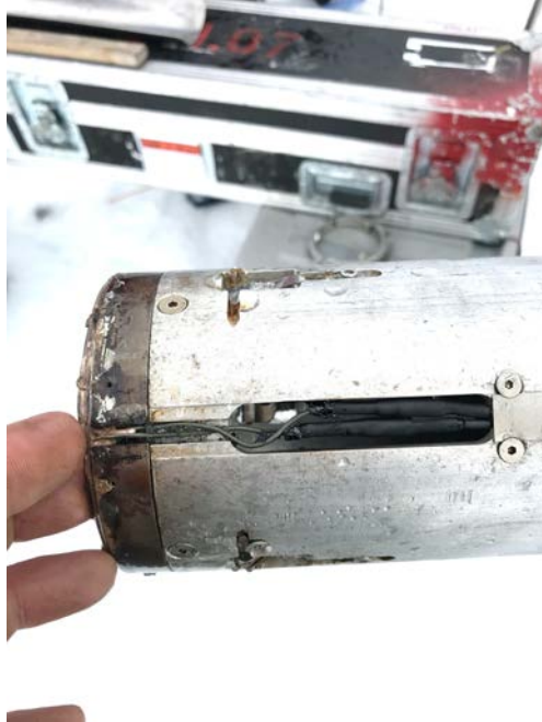
Figure 6. Connection between heat ring and drill cable.

9.9.2 Installing the new heat ring – Install the new heat ring into the end of the barrel so the wire tail is aligned with the groove holding the tail wires in proper alignment. Replace the four flathead screws that hold the heat ring to the barrel. Carefully press the connections into the slot in the core barrel. Press the two tail wires into the groove along the length of the barrel and replace the cover strip; then replace all screws. Attach the connector last.