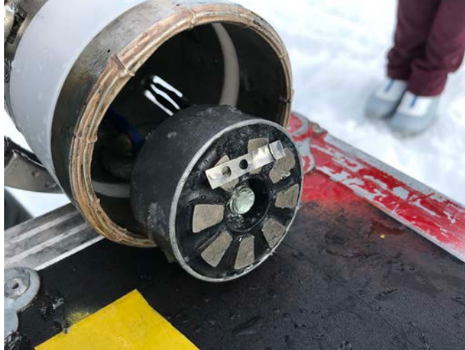
Figure 1. A magnet can be used to retrieve steel debris downhole.