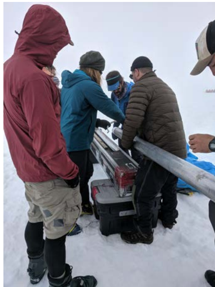
Figure 5. Hold the drill barrel out to the side to remove the core.

NOTE: Always leave about 5 cm of space between the top end of the core to the hanger so that you have room to push the core up to release the core dogs.