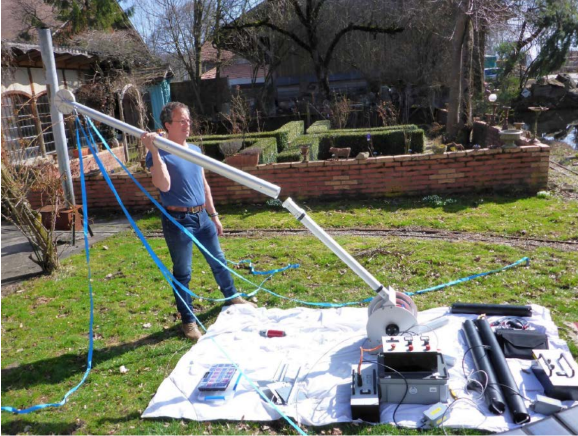
Figure 2: Assembling the tower