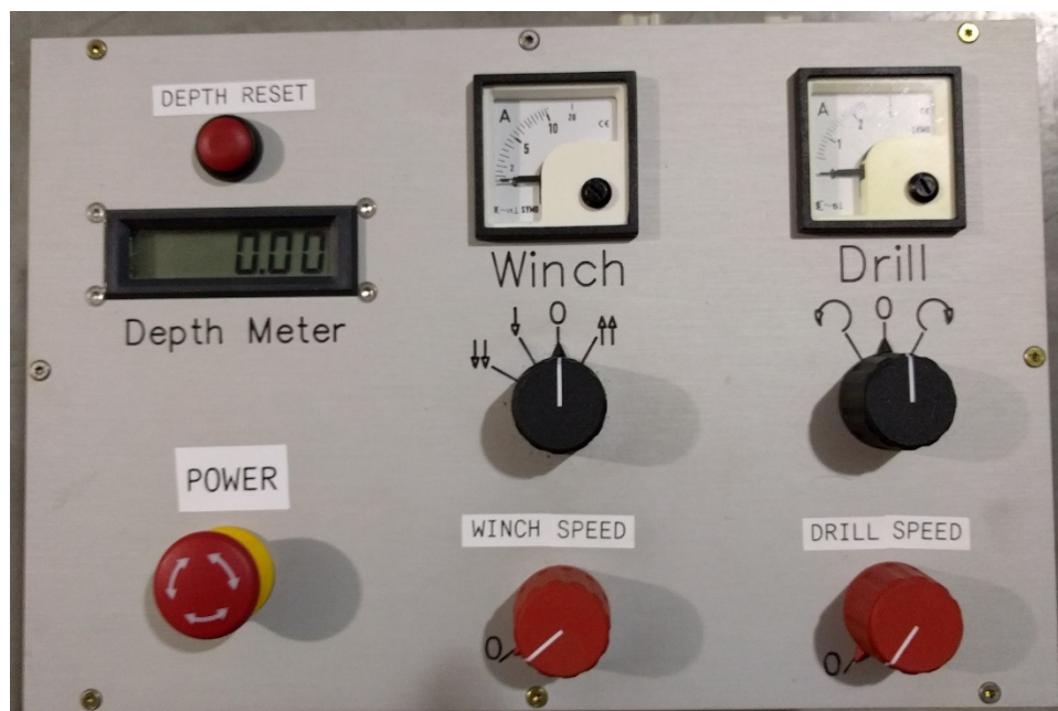
Figure 9: Control Box Faceplate

14.2 Rotate the drill control knob to clockwise drilling. Then rotate the drill speed knob to approximately the 3 o'clock position.