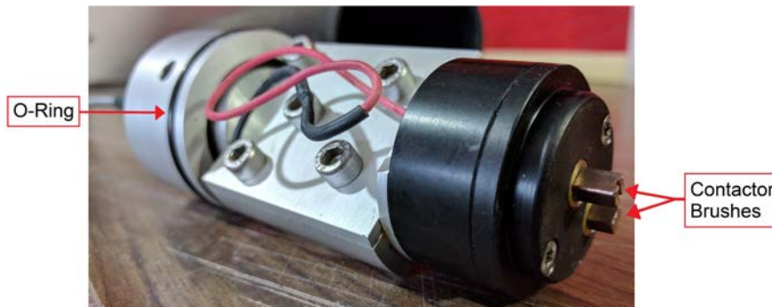
Figure 5: Cable end

12.2 Inspect the O-ring and brushes for damage. Figure 5. Replace as necessary.