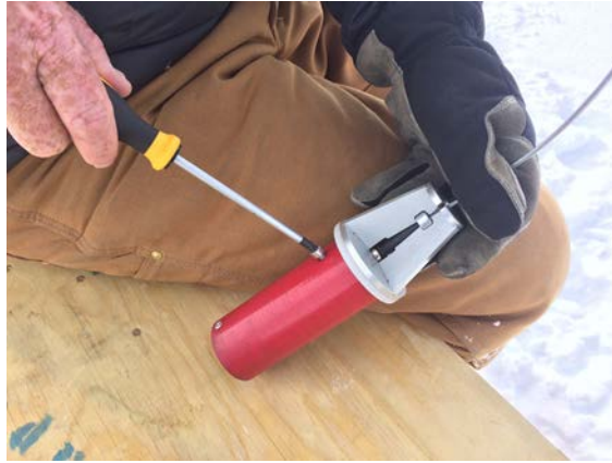
Figure 4: Removing the cable head cover

12.1.1 Take extra care while the cover is removed. It does not take much lateral force to snap off the contactor brushes. Figure 5.