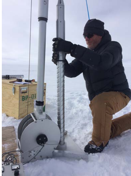
Figure 10: Manual anti-torque