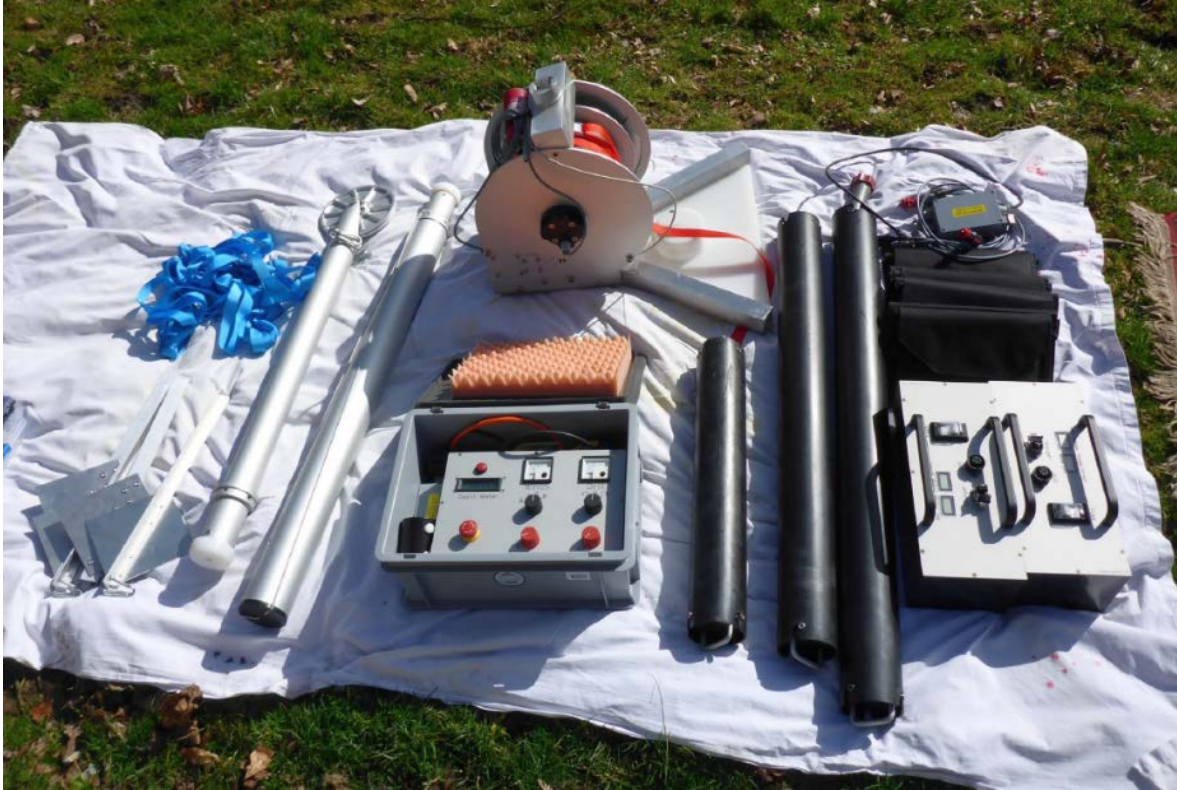
Figure 1: Drill ready for installation

10.4 If the site is not level, place the winch base with the drill hole facing downhill.