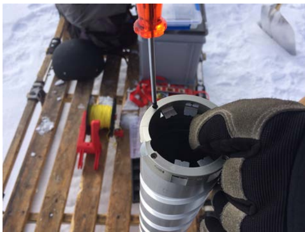
Figure 7: Attaching the cutter head