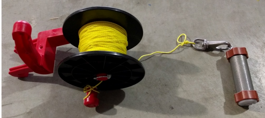
Figure 12: Falling weight