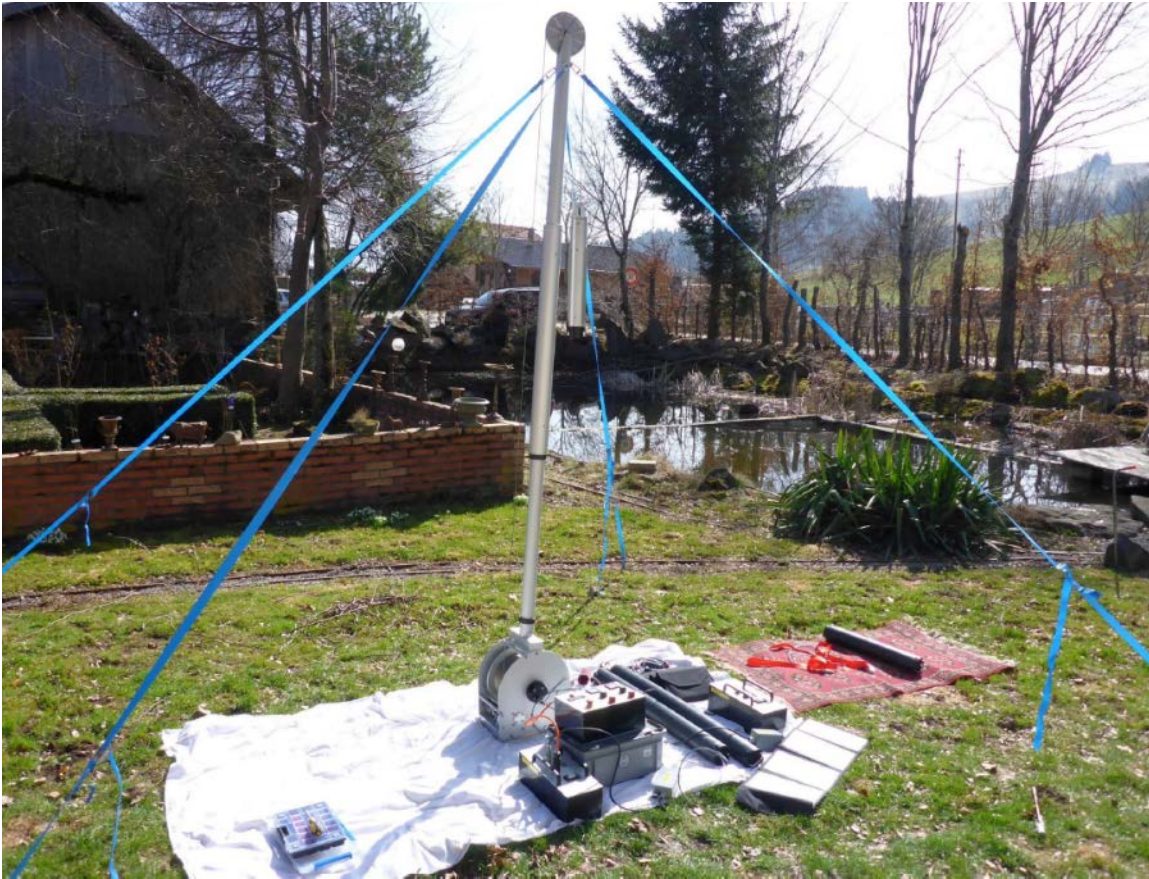
Figure 6: Ready for drilling