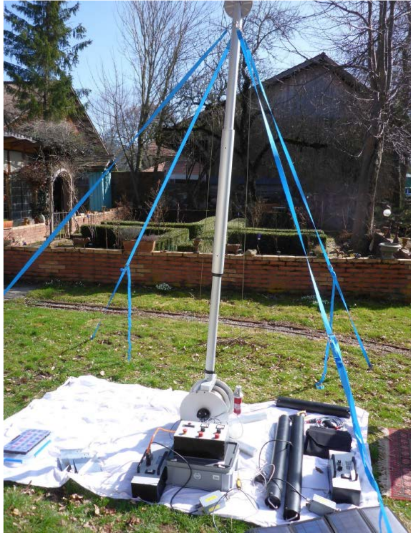
Figure 3: Adjusting the tower