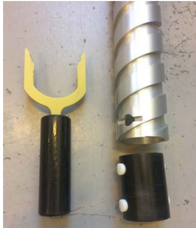
Figure 8: Barrel clutch adapter and separator tool

13.4 Lower the drill sonde until the cutter is just touching the surface. Then reset the depth counter.