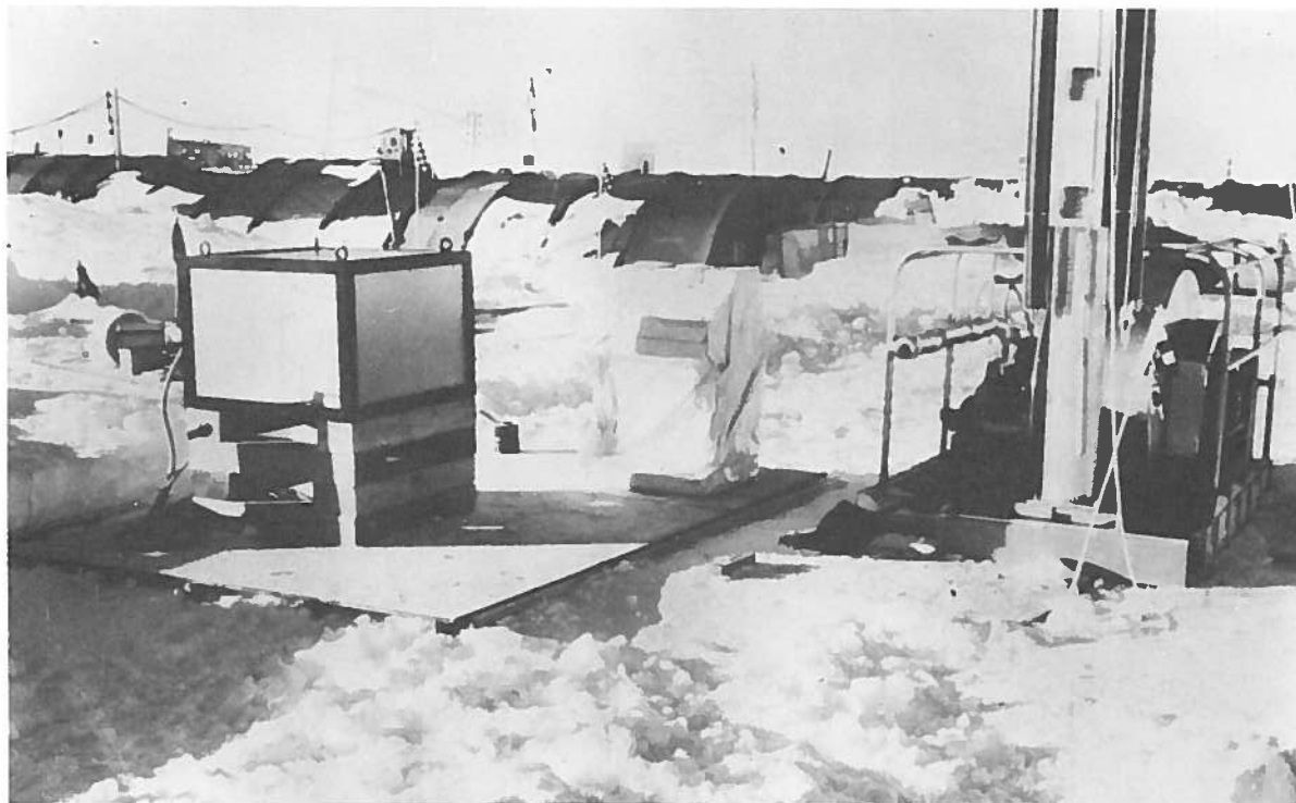
Figure 3. General view of the equipment: Inverter (left); Control consol (middle); Winch platform with tower (right).